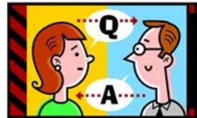
But Why? — But Why Here?

contributing to underage drinking. Alcohol was selected based on the Needs Assessment completed in 2006 and the data collected on the Search Institute Survey indicating 25% of eighth graders and over 60% of eleventh graders reported attending a party in the last year where peers were consuming alcohol. In addition, over 20% of eighth graders and 30% of eleventh graders report using alcohol in the last 30-days.