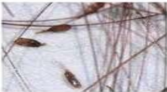
Head lice nits or eggs